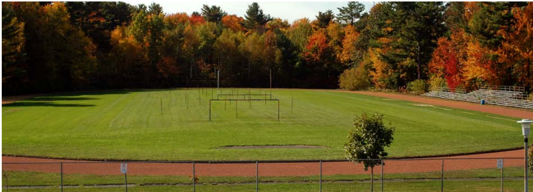
The football field and track: a reminder of the social environment of Bell High School.